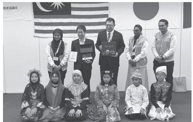
Malaysia SKS6 Elementary School - Courtesy Visit to Mayor Ito of Tokoname City