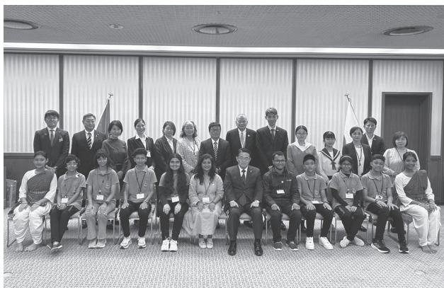
Bangladesh Playpen School - Courtesy Visit to Governor Omura of Aichi Prefecture