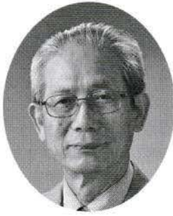
Tokoname Lions Club President