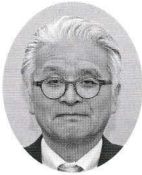
Former Superintendent of Tokoname Board of Education