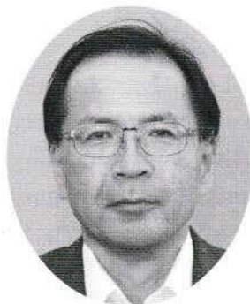
Superintendent of Tokoname Board of Education

Finally, I would once again congratulate the success of TSIE and hope that TSIE's activities will continue and play a more important role in the communication and exchanges with foreign countries.