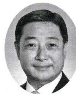
Member of the Aichi Prefectural Assembly

I hope that the programs will make people who have a wide mental horizon. I wish that the activity will continue and develop from now on.