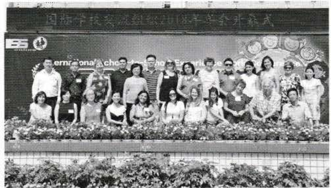
Conference in 2018