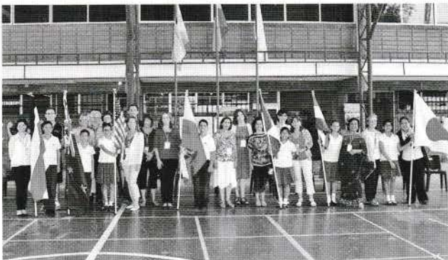
Conference in 2016

Next conference will be held in Mexico City in 2020.