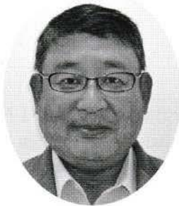
Tokoname Rotary Club Preisident